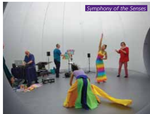
Symphony of the Senses

Eye Music Trust presents its new production: Symphony of the Senses . This was funded by Arts Council England Strategic Touring Fund and has toured around England throughout 2016.